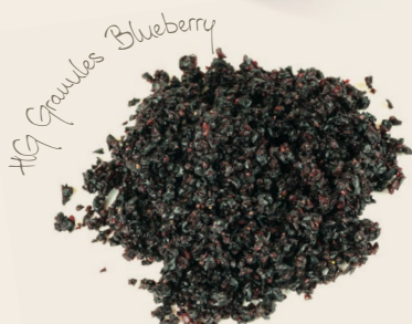
HG Granules Blueberry