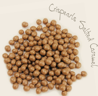
Crispearls Salted Caramel