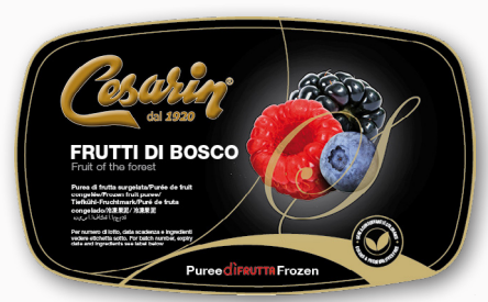
Fruit of the forest